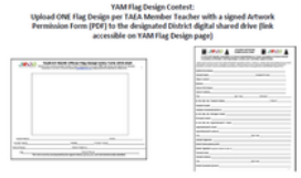
THIS IS WHAT YOUR ARTWORK SHOULD LOOK LIKE FOR THE YAM SPRING EXHIBITION.

TO DOWNLOAD THE PREPARATION INSTRUCTIONS